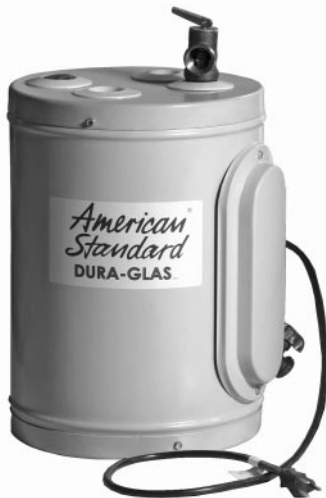
Model CE-2 1/2-AS